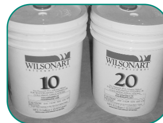
WA 10 - $45.60 WA 20 - $47.40