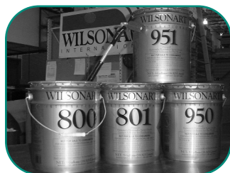
WA 800/801 - $47.00 WA 950/951 - $43.90