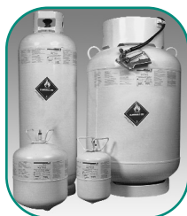
Medium - $189 Large - $699