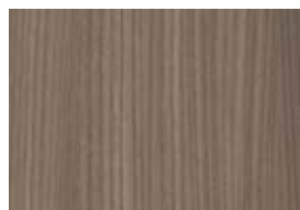
Valley Forge Elm