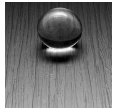
79 - Ridgewood Finish

The Ridgewood Finish (79) is an overall matte finish with ridged dimensional features creating a linear woodgrain effect. The Gloss Line Finish (28) is a linear woodgrain texture with varied widths of narrow grain structures in an alternating mix of matte and gloss surface areas.