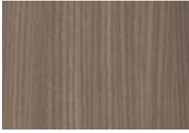
Valley Forge Elm