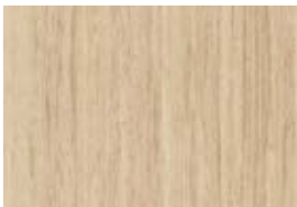
White River Forest