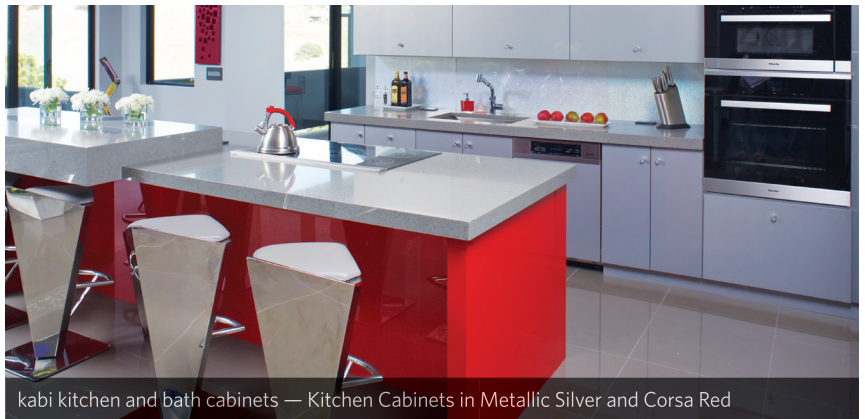
kabi kitchen and bath cabinets — Kitchen Cabinets in Metallic Silver and Corsa Red

The flawless surface is as beautiful as it is functional, making it perfect for modern interior design such as; cabinetry, vanities, wall paneling, furniture, store fixtures and displays.