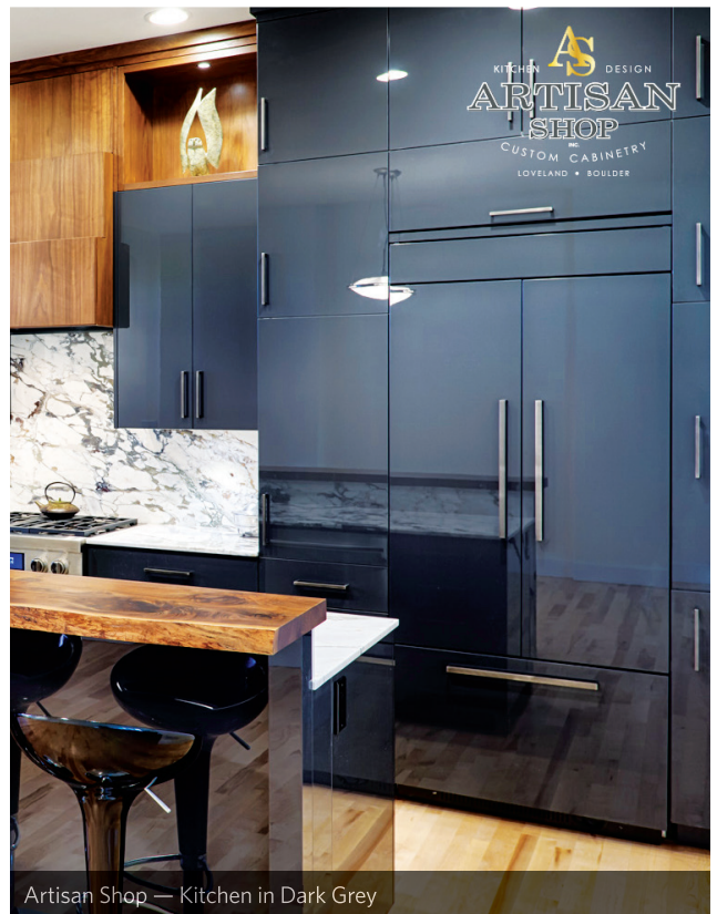
Artisan Shop — Kitchen in Dark Grey