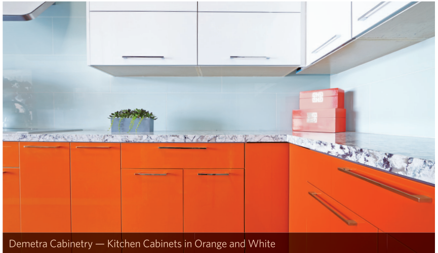
Demetra Cabinetry — Kitchen Cabinets in Orange and White