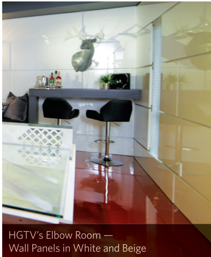
HGTV's Elbow Room — Wall Panels in White and Beige