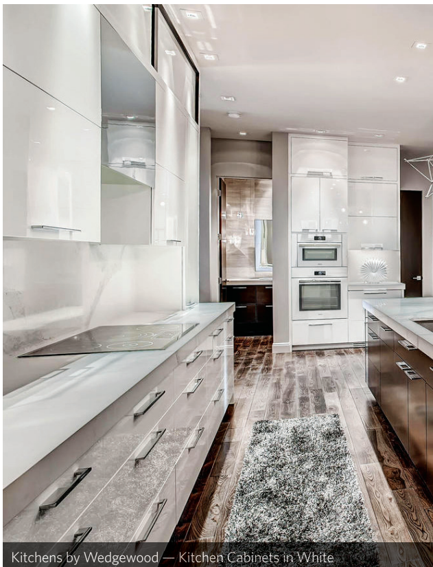
Kitchens by Wedgewood — Kitchen Cabinets in White