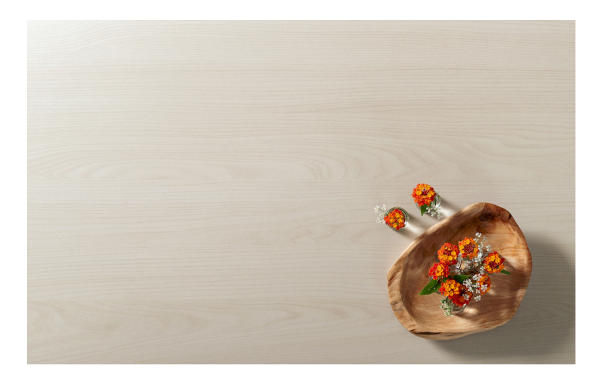
Call us for Wilsonart Traceless today!

Traceless™ provides an in-demand mix of beauty and practicality. Ideal for high-touch areas throughout any space. This collection includes our elegant elm designs, which capture the depth and richness of elm with authentic tones and exceptionally touchable textures.