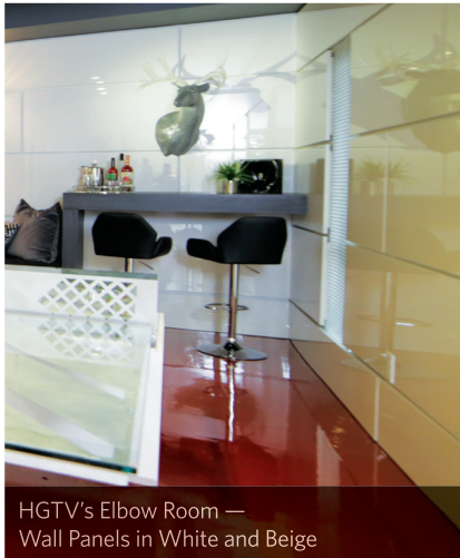
HGTV's Elbow Room — Wall Panels in White and Beige