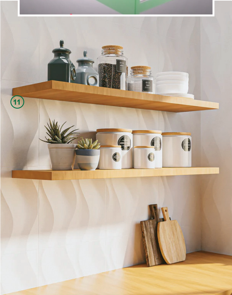
5: Wire Pull Satin Chrome (Salice) 6: Vibo Waste Bin Single or Double (Salice) 7: Closet Rod Round Steel Chrome (Salice) 8: Support Round Screw Open Chrome (Salice) 9: 4942 Crisp Linen (Wilsonart LUJO) 10: XTreme Ball Bearing Slides (FGV) 11: Hovr Bracket Slim

Smart design starts with streamlined function. Maximize storage and accessibility with solutions like XTreme Ball Bearing Slides from FGV , slim floating shelves from Hovr , and sleek hardware from Salice . Pair with Wilsonart® LUJO designs from our Interior program and coordinated finishes from Wilsonart to create spaces that are clean, clutter-free, and effortlessly organized.