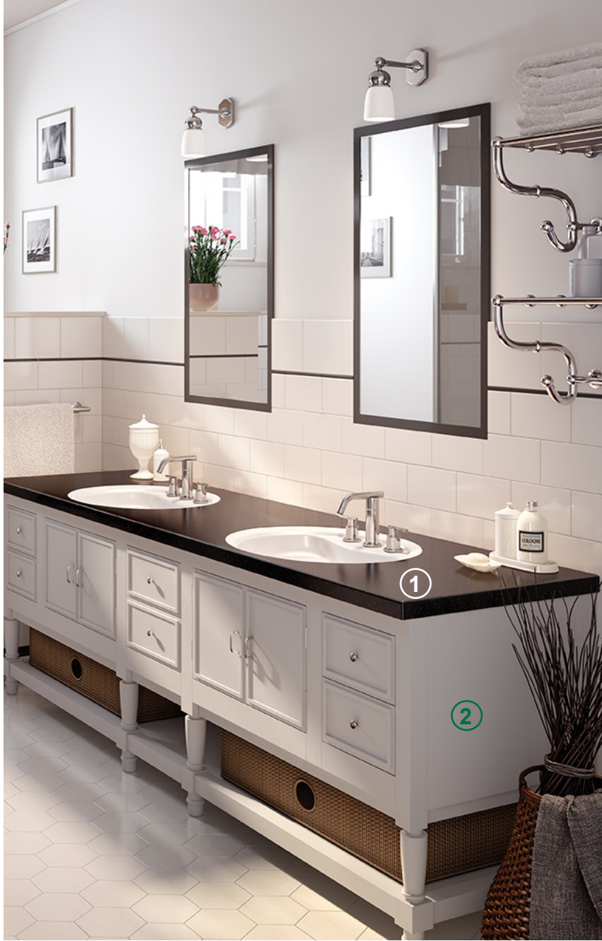
1: 9092MG Black Onyx Mirage (Solid Surface) 2: W919 Cotton White (ARAUCO PRISM TFL)

Create bathrooms that are as functional as they are beautiful. From easy-to-clean Wetwall™ by Wilsonart® to seamless Solid Surface and durable Quartz countertops , our material solutions support high-performance spaces designed for daily use. Add warmth and style with ARAUCO Prism® TFL for cabinetry and storage—perfect for helping residents start their day with ease and efficiency.