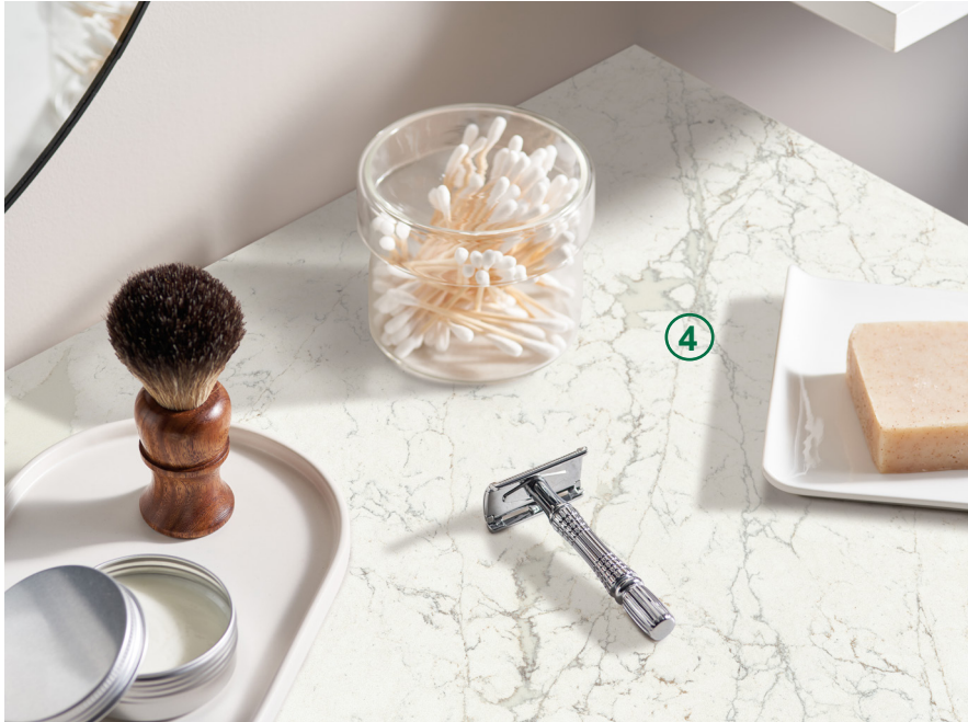
3: W7008 Torrone Marble (Wetwall) 4: Q4067 Calacatta Olympus (Quartz)