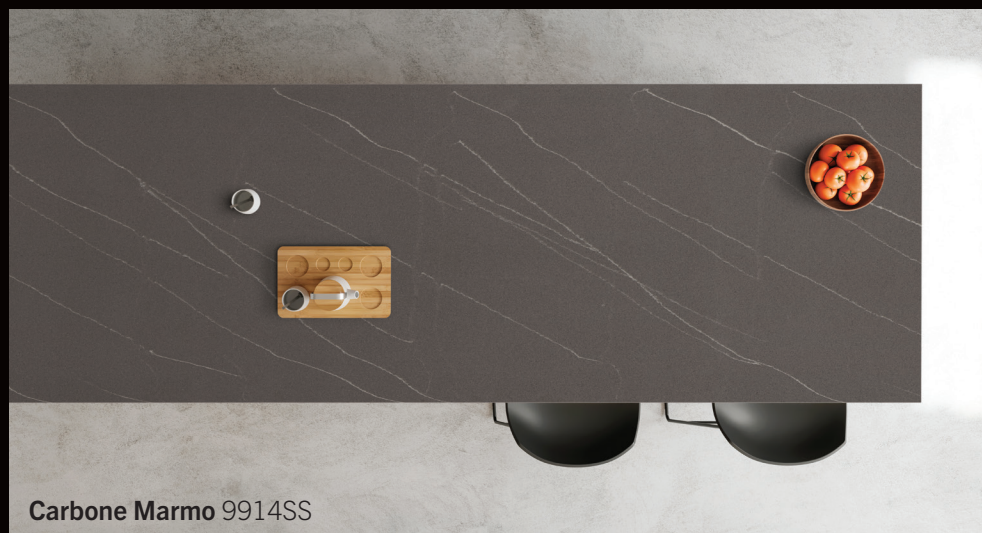
Carbone Marmo 9914SS