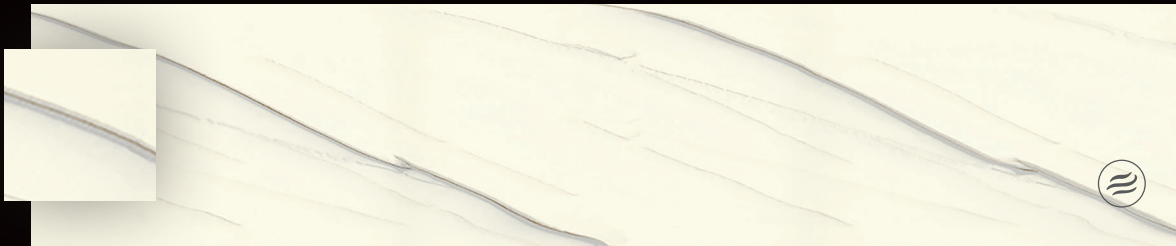
Monte Paradiso 9916SS