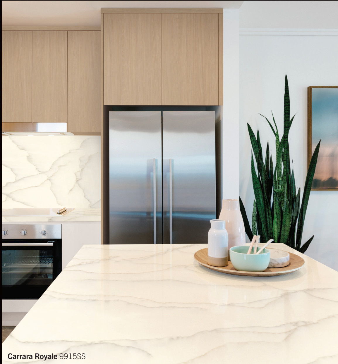
Carrara Royale 9915SS