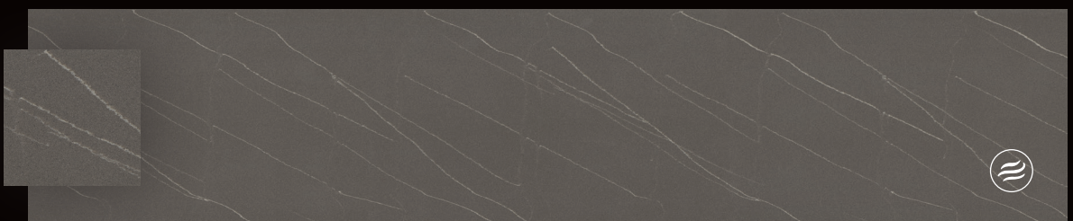
Carbone Marmo 9914SS