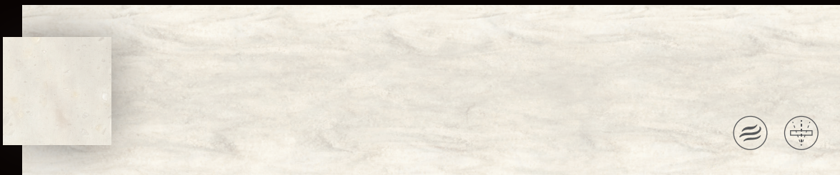
Sierra Quartzite 9257SS