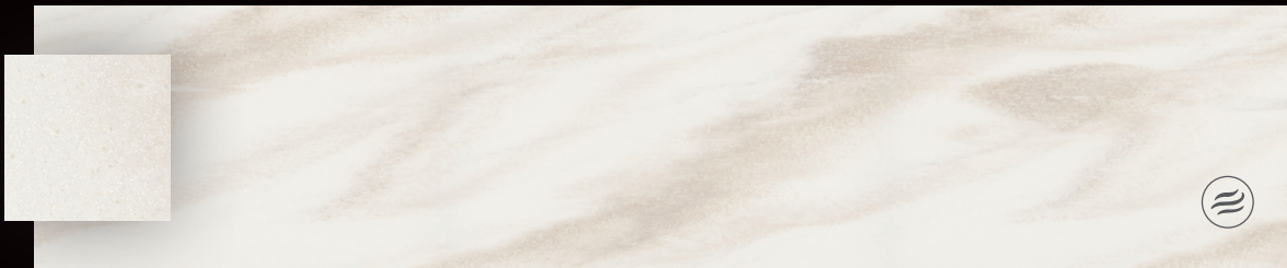
Opulent Luxe 9918SS