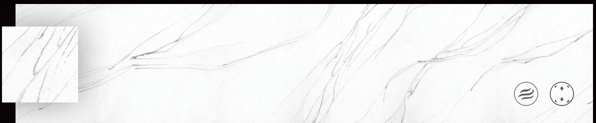
Ice Statuario 9912SS