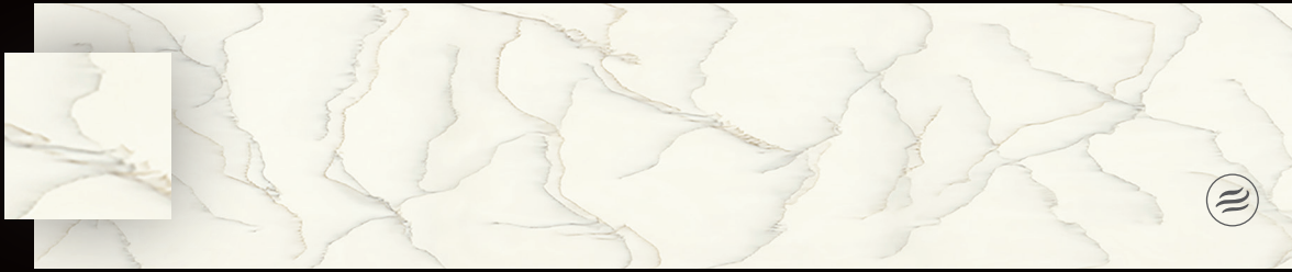
Carrara Royale 9915SS