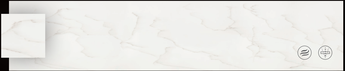
Carrara Emporio 9909SS