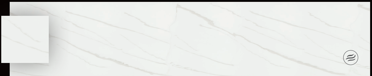
Monte Amiata 9911SS