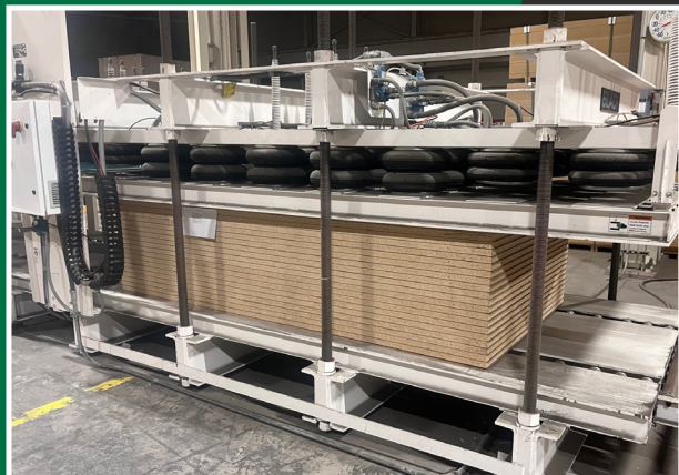
Laminated Panels System