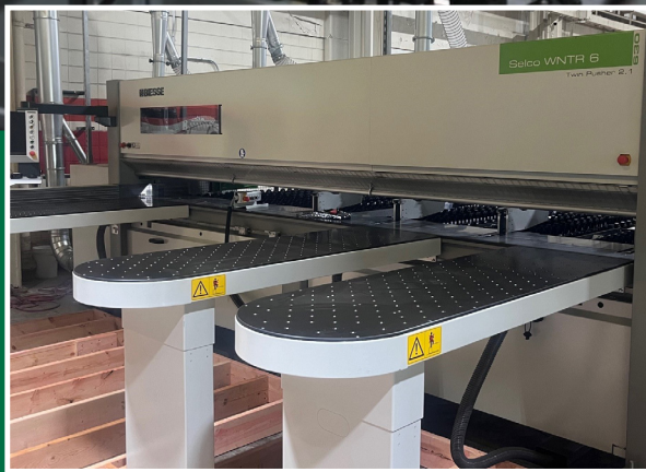
Biesse Beam Saw